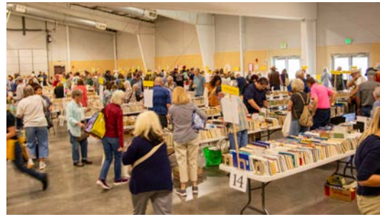
Outside view of the McKee Building (left) and people at the Friends of the Loveland Library Spring Book Sale (right).