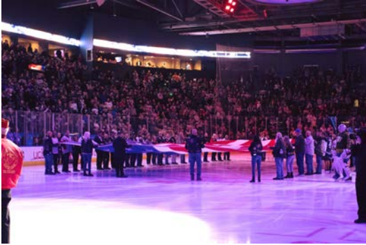
Outside view of the Blue Arena (left) and people singing the National Anthem at a Colorado Eagles hockey game (right).