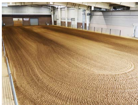
Cowboy riding a bucking horse at the PRCA Ram Mountain States Circuit Finals Rodeo (left) and the inside of the new expanded warm-up space (right).