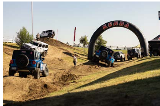
Larimer County Fair carnival rides (left) and jeeps at the Overland Expo Mountain West 2023 event (right).