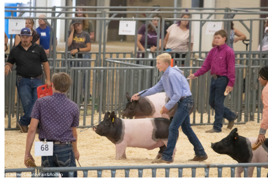
4-H cake decorating entries (left) and a 4-H hog show (right) at the Larimer County Fair.