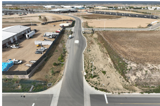
Aerial footage taken in January (left) and October 2023 (right) of internal roadways at The Ranch, which is a part of the Arena Circle and Roadway Improvements project.