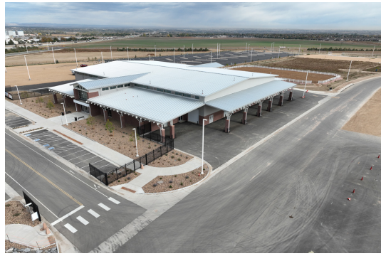
Aerial footage taken in January (left) and October 2023 (right) of The Ranch Youth and Community Arena.