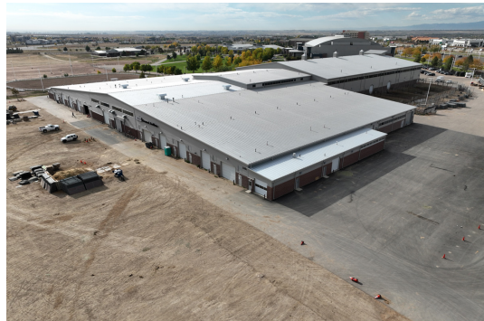
Aerial footage taken in January (left) and October 2023 (right) of the MAC Equipment, Inc. Indoor Arena.