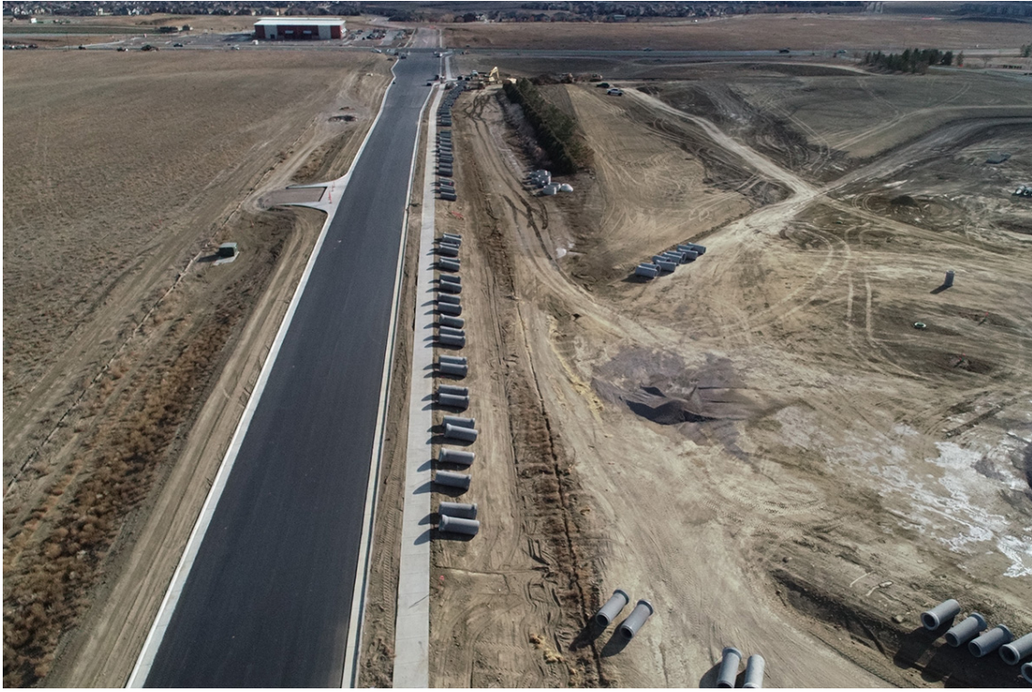
Aerial footage taken in November shows the newly opened Andalusian Drive just north of the future locations of the 4-H, Youth and Community Livestock Arena and RV hookups.

to enjoy. The infrastructure updates will improve traffic flow throughout the Complex and enhance the safety of visitors moving between facilities at The Ranch. This work is anticipated to be completed in summer 2023.